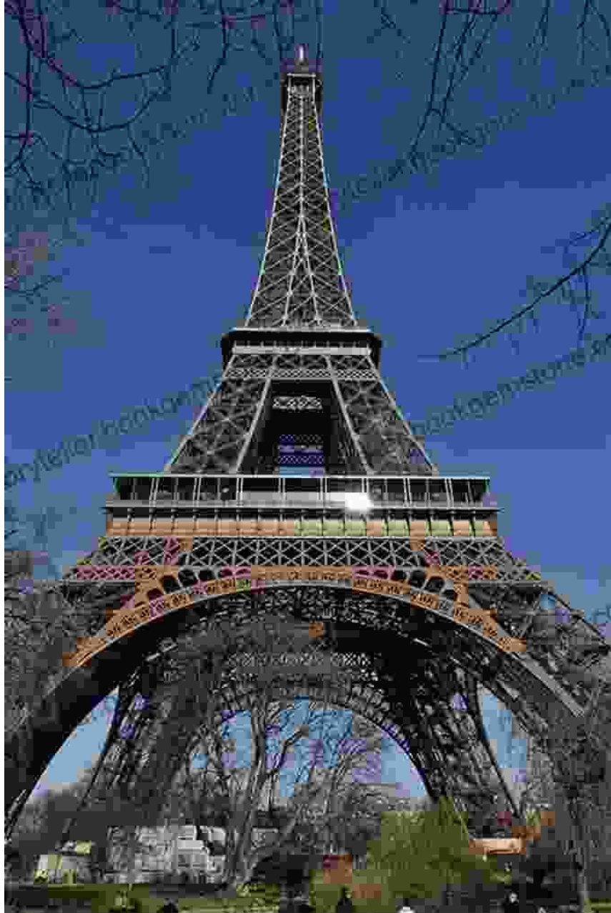
The Eiffel Tower in Paris, France.