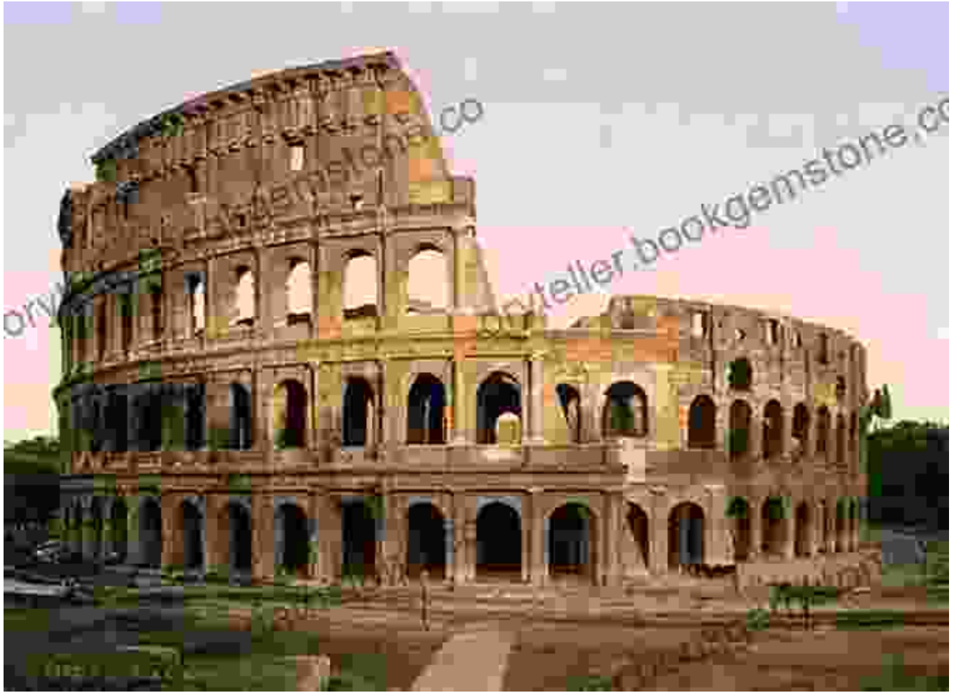
The Colosseum in Rome, Italy.