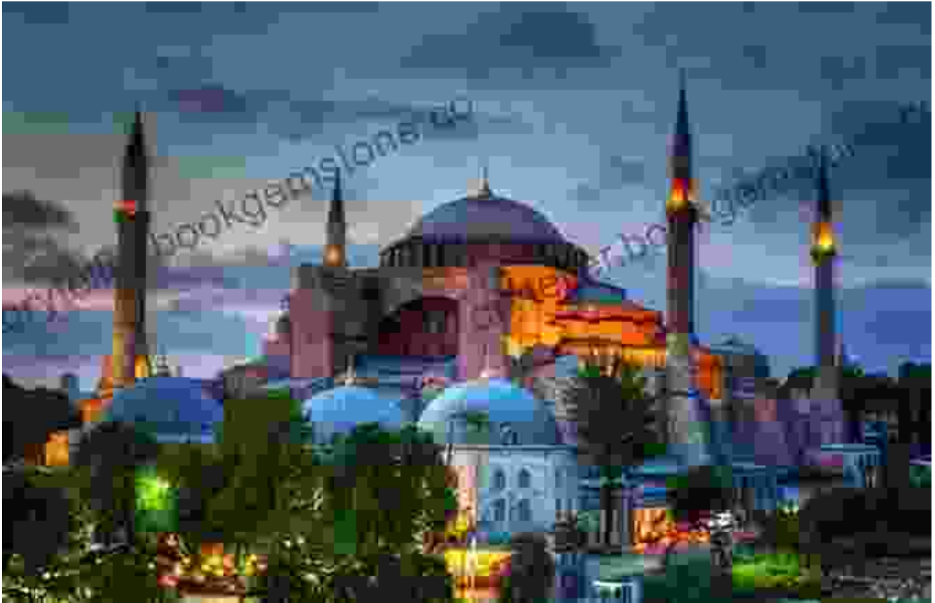
The Hagia Sophia in Istanbul, Turkey.