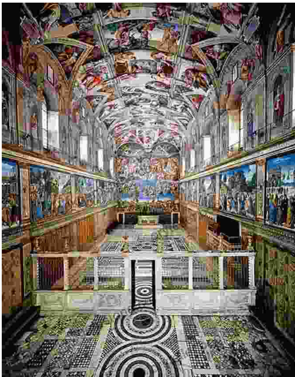
Michelangelo Icon Editions engraving of the Sistine Chapel ceiling