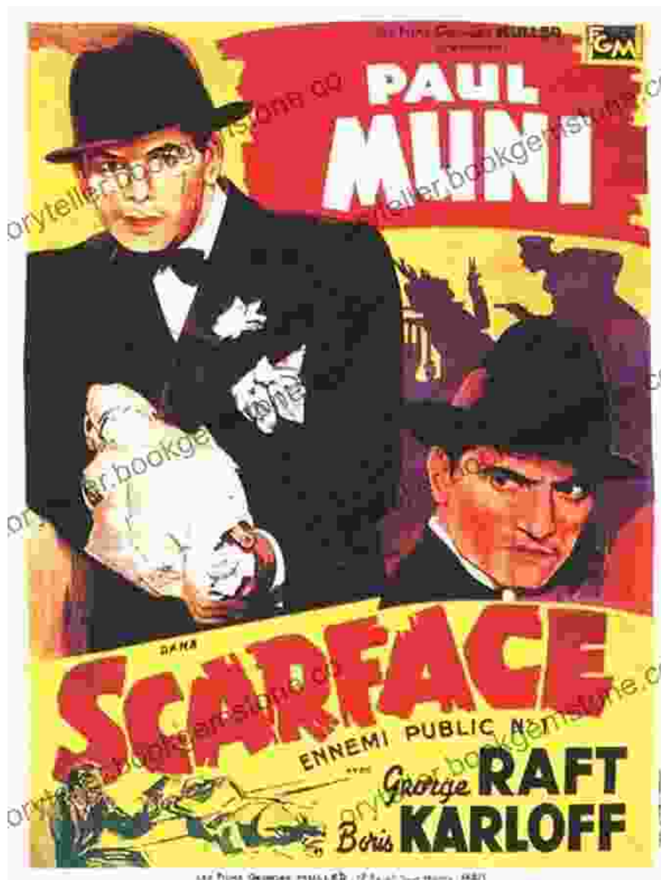
Scarface (1932) - A groundbreaking gangster film starring Paul Muni