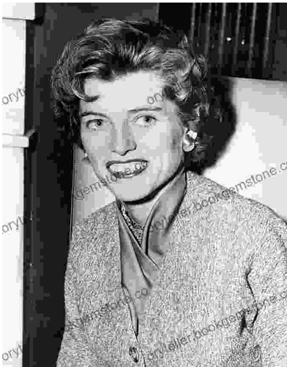
Eunice Kennedy Shriver with athletes at the Special Olympics.

In 1968, Eunice founded the Special Olympics, an international organization that provides sports training and competition opportunities for children and adults with intellectual disabilities. The first Special Olympics Games were held in Chicago, Illinois, with over 1,000 athletes participating.