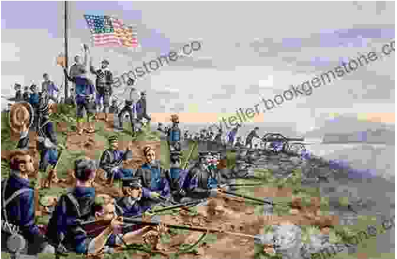
Favel's photograph of the Spanish-American War