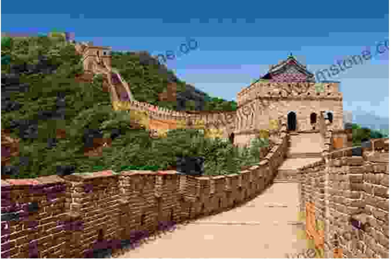
Favel's photograph of the Great Wall of China