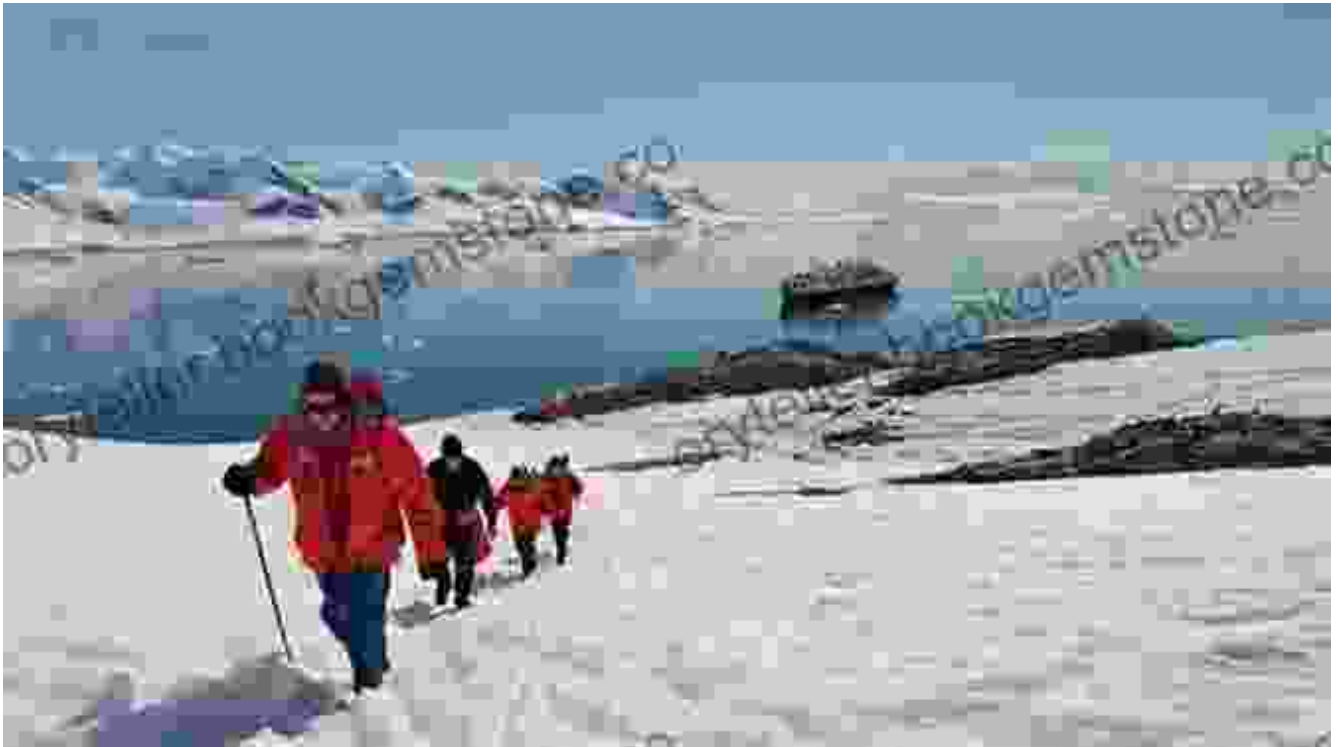
Image Description: Ashley Antoinette, a renowned travel photographer, is leading a group of adventurers on an Antarctica expedition. The group is bundled up in warm clothing and is surrounded by snow and ice. They are smiling and looking out into the distance.

To learn more about Ashley's Antarctica expeditions and to secure your spot on this once-in-a-lifetime adventure, visit the Little Grey Box website.